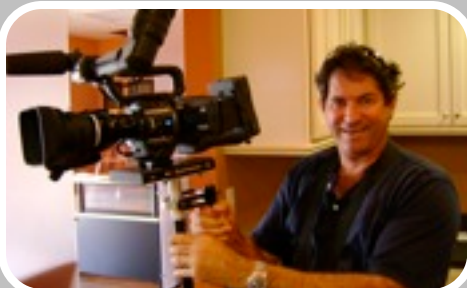
JVC ProHD on varizoom stabilizer