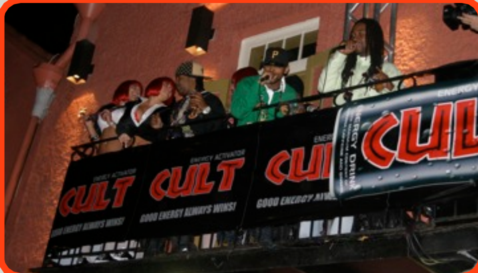
BOURBON STREET BALCONY WITH THE CULT GIRLS & PARTNERS IN CRIME