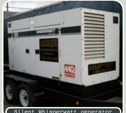
Silent Whisperwatt generator