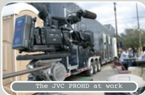
The JVC PROHD at work