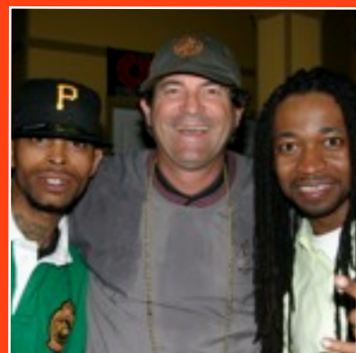
WITH MY PARTNERS IN CRIME